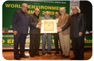
Padam Shri Mr. M C Mehta Environmentalist and Green Lawyer of SC India