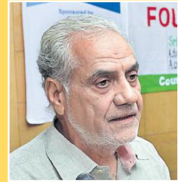
Padma Shri Mr. M. C. Mehta Environmentalist and Green Lawyer Supreme Court of India, New Delhi